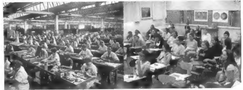
Early 20th century factory and modern classroom